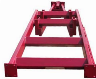
Heavy duty tubular frame with 6500 lbs tandem torsion axles and truck bed liner coating on frame.