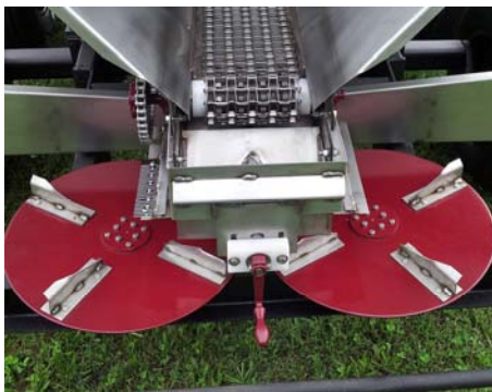
Bottom mounted gearbox driven 20" spinner plates and stainless steel spinner blades.