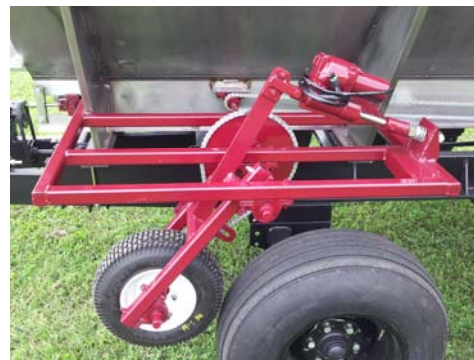
Hydraulically operated press wheel w/ easy switching high rate to low rate.