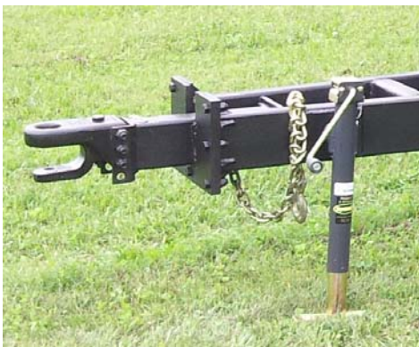
Heavy duty forged steel adjustable hitch and safety chain.