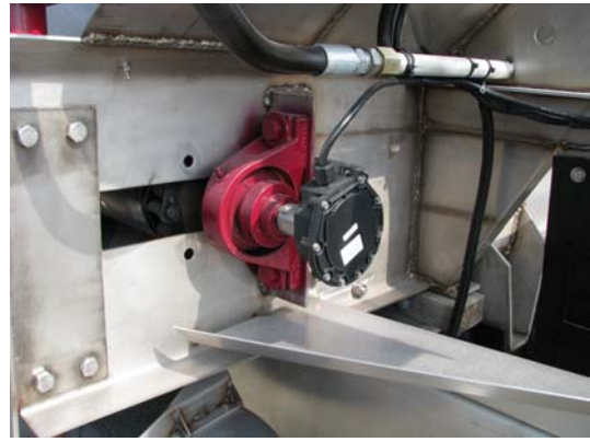
Shaft mounted rate sensor for automatic rate control.