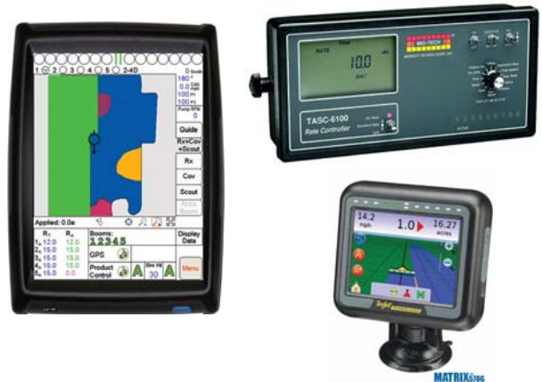
Your choice of rate controller and or GPS guidance accessories