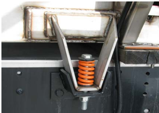
Spring Mounted Body Tie Downs