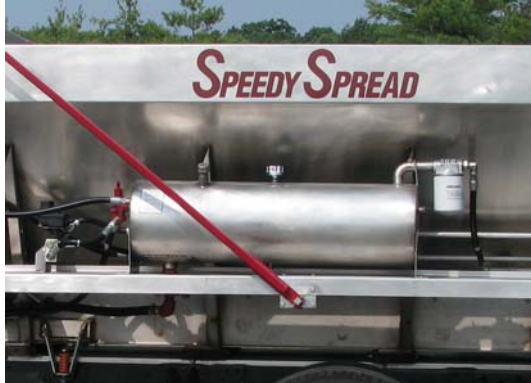
Large capacity stainless steel hydraulic oil tank w/ shut off valve and return filter