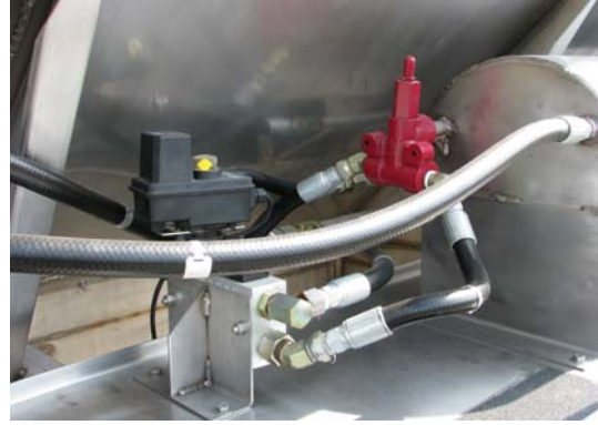
Hydraulic control valve for conveyor control and in line pressure relief valve